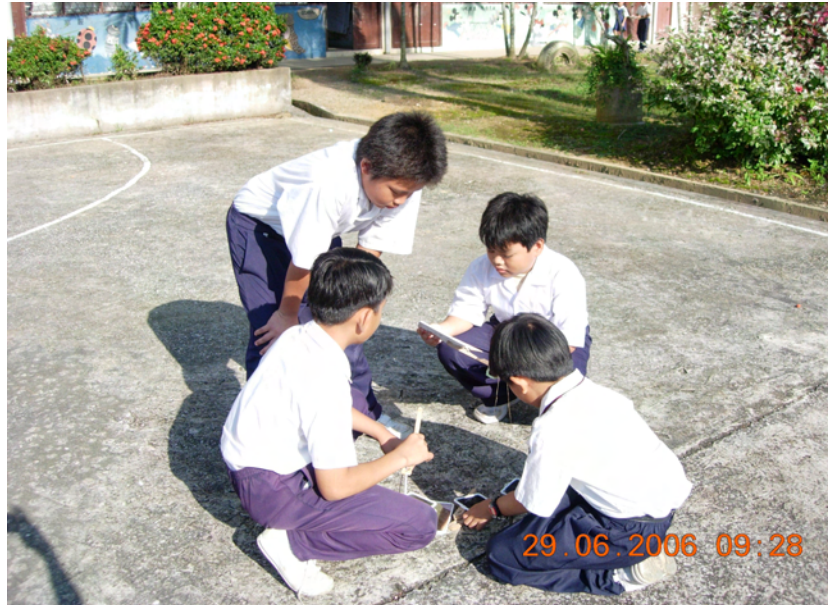
Photograph 4: Pupils trying out their experiments (Lesson 3)