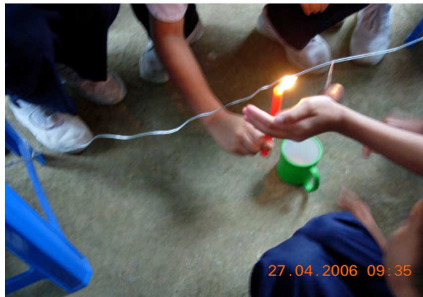
Photograph 2: Pupils in of the groups trying out their experiment (Lesson 2)